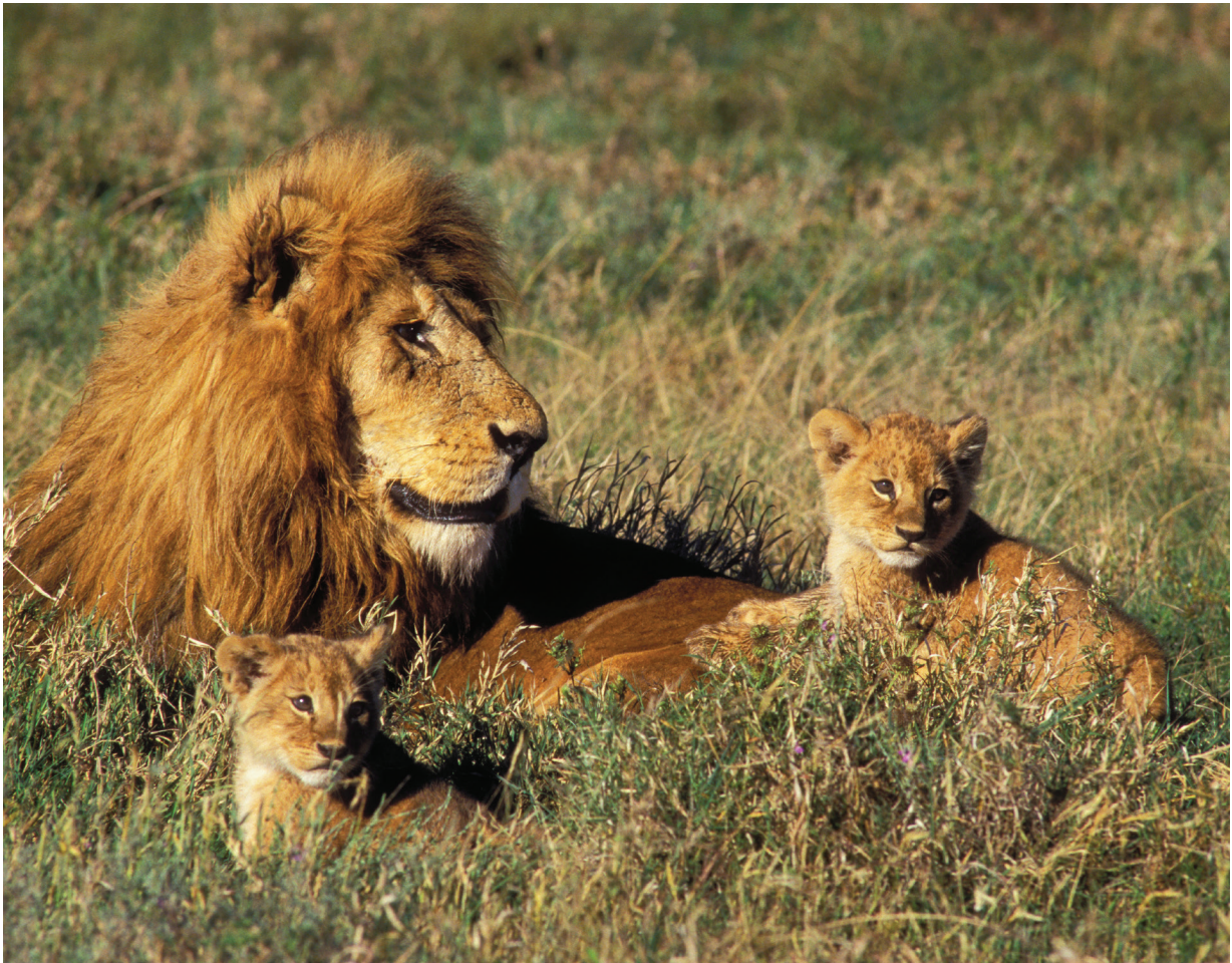
We may see lions, among other big game, while on safari.

Day 2: Arrive Johannesburg Upon arrival we transfer to our hotel in the suburb of Rosebank, where our rooms will be ready for our early check-in. As guests' arrival times may vary greatly, we have no group activities planned. B