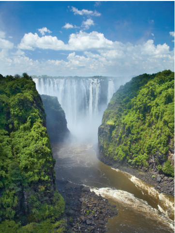
Victoria Falls, the "smoke that thunders"

Day 10: Chobe National Park/South Luangwa National Park, Zambia This morning we board a plane for the flight to South Luangwa National Park. Here in one of Africa’s last stretches of pristine wilderness we have the chance to get closer to the animals than anywhere else. Late afternoon we engage in some of the lodge’s game-viewing