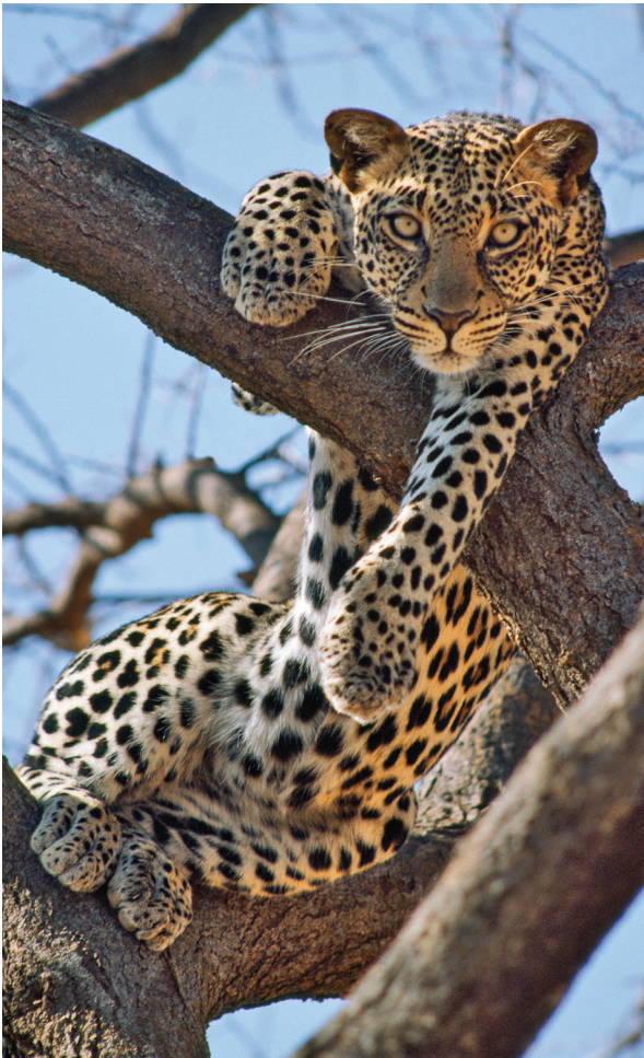
Getting comfortable ...

Day 14: Arrive U.S. We arrive in the U.S. this morning and connect with our flights home.