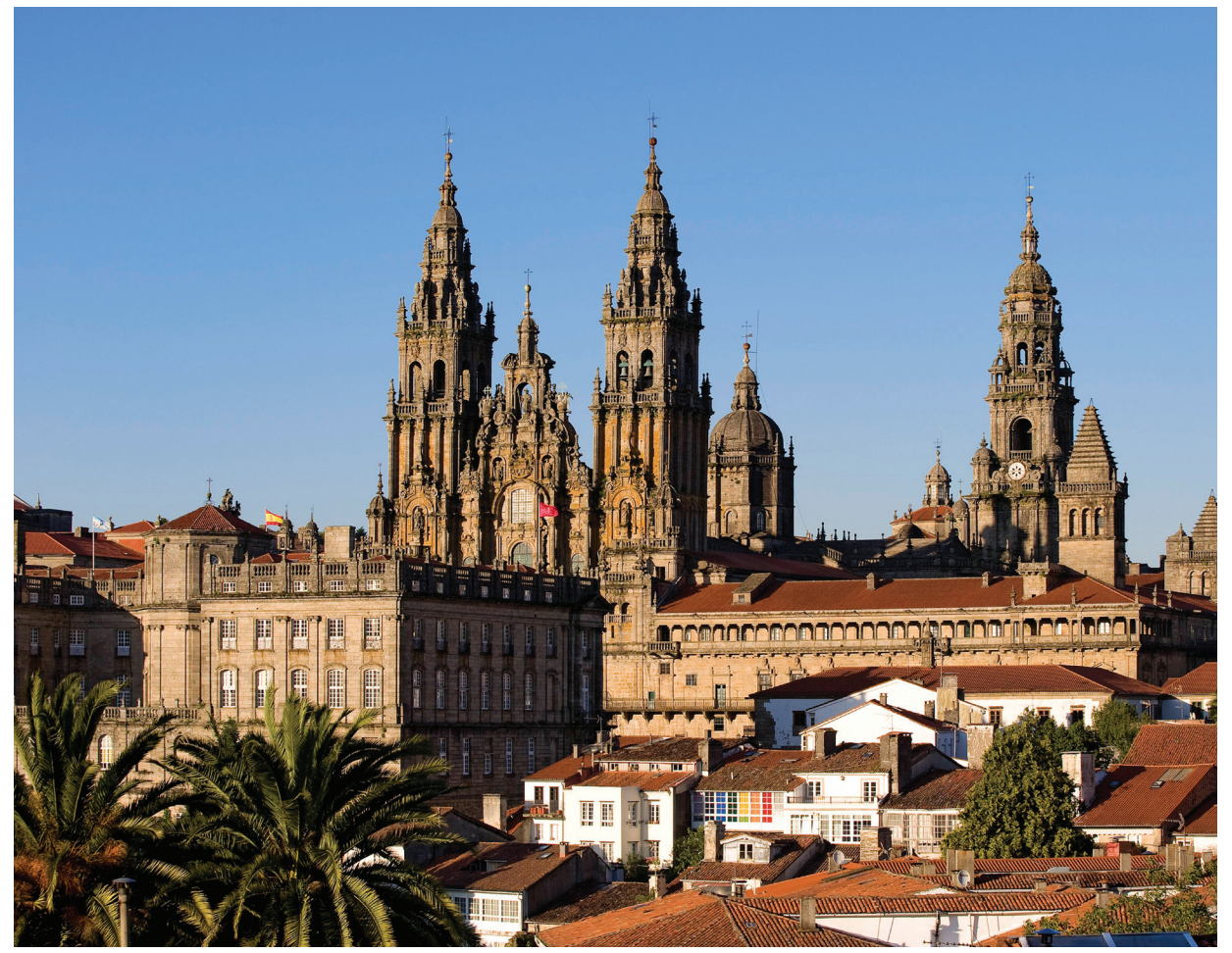
Santiago's 11<sup>th</sup>-century cathedral, which we visit on Day 7, is the last stop on the pilgrimage route of the Way of St. James.

Ratings are based on the Hotel & Travel Index, the travel industry standard reference.