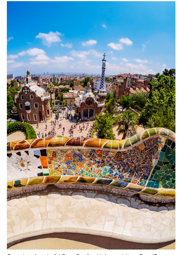
Barcelona's colorful Parc Guell, which we visit on Day 15