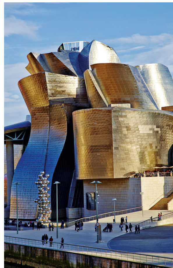
Bilbao's iconic Guggenheim Museum

Day 16: Barcelona Our Gaudí tour continues this morning at Casa Milà, whose curving stone face inspired the nickname “La Pedrera” (stone quarry). Now housing a cultural center, Casa Milà is a UNESCO site. This afternoon is at leisure; tonight we bid judios! to Spain and our fellow travelers at a farewell dinner. B,D