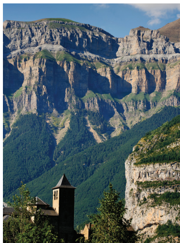
We spend two nights in the Pyrenees.

Day 11: Bilbao/Basque Country A day-long excursion begins with a poignant stop: Gernika (Guernica), heart of the Basque region and the town razed by