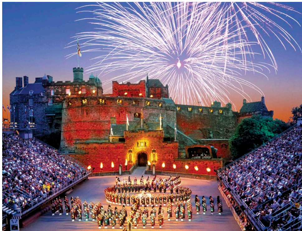
Royal Edinburgh Military Tattoo

In Perth, enjoy a guided visit at Scone Palace, the ancient coronation site of Scottish monarchs including Robert the Bruce. Admire the beautiful period rooms and grounds. Enter the Murray Star Maze and see if you can find your way out! Head next to Crieff and tour Glenturret Distillery, Scotland's oldest working distillery. Learn about their traditional methods of making fine whisky and savor a tasting.