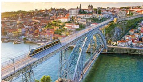
Top: Douro Valley | Above: Porto