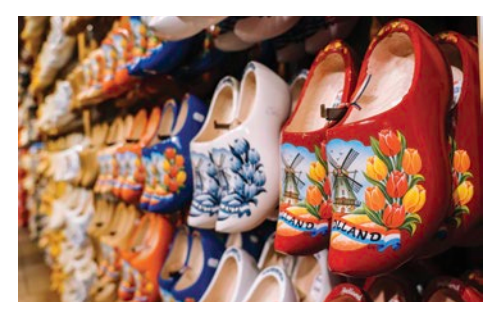
Top: Amsterdam | Above: Traditional wooden shoes