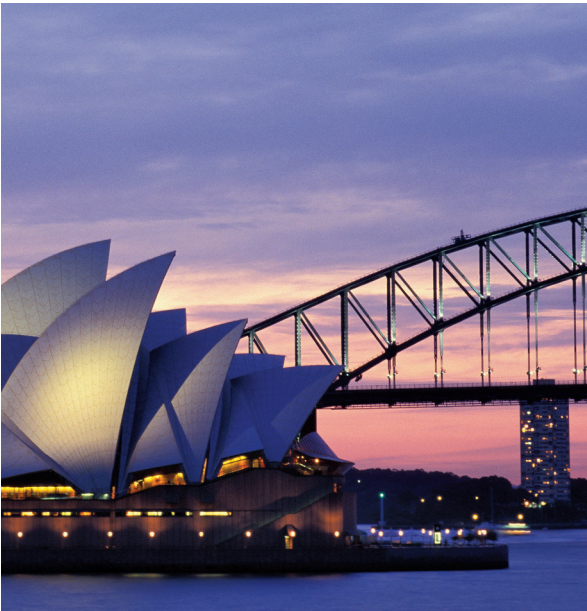
The Sydney Opera House and Harbour Bridge at dusk

Day 21: Auckland Our half-day tour of this city set atop 48 volcanic hills features glittering Auckland Harbour and the America’s Cup Village. We also visit the War Memorial Museum, with its prized Maori and Pacific Islander collections. Tonight we enjoy a farewell dinner at our hotel. B,D