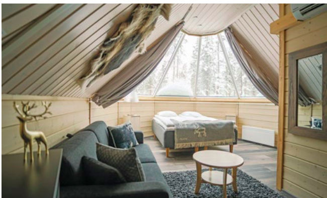
Northern Lights Village | Saariselkä