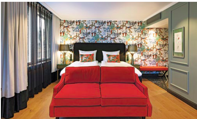
Hotel U14 | Helsinki