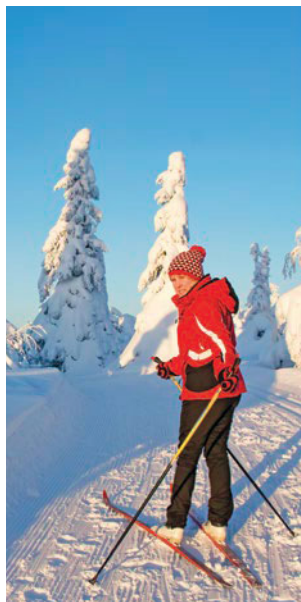
Exploring at Northern Lights Village