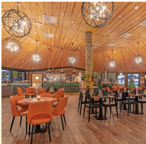
Restaurant, Northern Lights Village