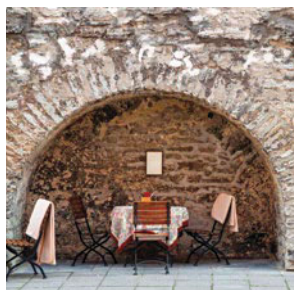
Old Town, Tallinn

Historic Center (Old Town) of Tallinn, Estonia