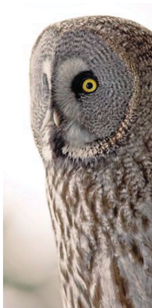
Great Grey Owl, Lapland