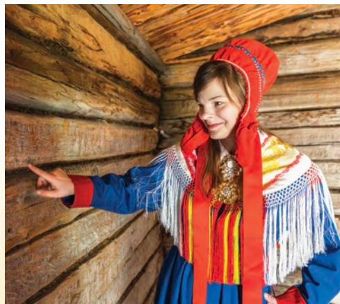
Sámi woman, Sámi Museum Siida

Sámi Museum Siida. View exhibits about the traditional livelihoods, customs and handicrafts of Finland's Sámi cultures at this fascinating museum in Inari. Explore an outdoor area with dwellings, dugouts, turf buildings and traps. Relish a delicious, authentic Finnish lunch.