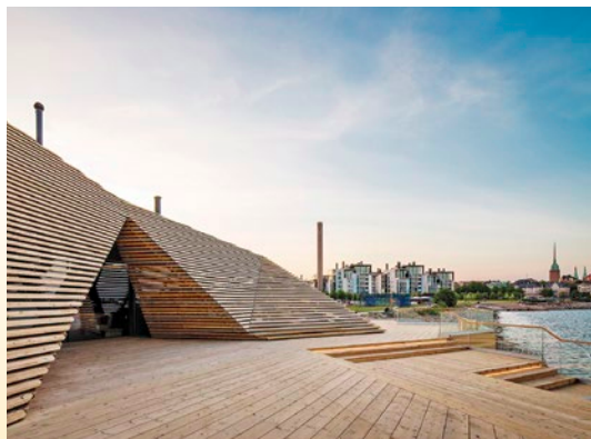
Löyly Sauna, Helsinki

Spend time getting settled in your cozy cabin and checking out the Village's lovely environs. Savor a tasty dinner in the Village's restaurant.