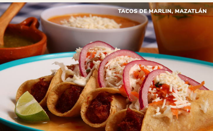
TACOS DE MARLIN, MAZATLÁN

To participate in a University of Michigan trip, all participants must be members of the Alumni Association of the University of Michigan. Please call the Alumni Travel team at (855) 764-0064 for more information.