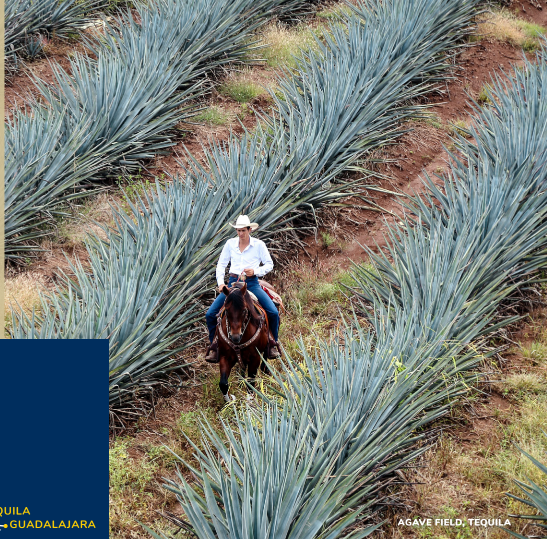
AGAVE FIELD, TEQUILA

We have not yet confirmed the AAUM study leader for this program. We intend, however, that you will be joined by an astronomer study leader who will enhance your travel experience. You will discover that our lecturers are not only first-rate scholars and teachers, but also friendly and approachable traveling companions, eager to share their insight and knowledge through informal conversation as well as in scheduled presentations.