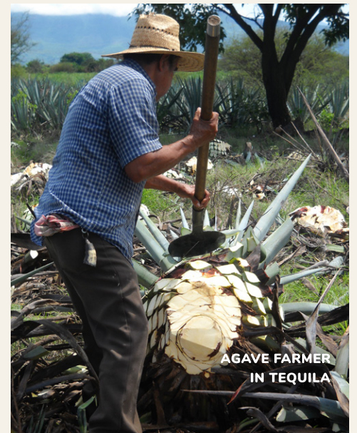
AGAVE FARMER IN TEQUILA

weather, and dust. To enjoy this trip, a spirit of adventure and anticipation and the desire to explore spectacular natural areas as well as urban areas are a must. There is a relatively long drive from Tequila to Mazatlán (approximately five hours), broken by a tour of the Ceboruco volcano and lunch. Travel is by motor coach.