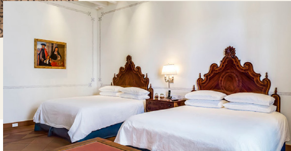
CLOCKWISE FROM TOP LEFT: QUEEN ROOM, QUINTA REAL; COURTYARD SEATING AREA AT HOTEL SOLAR DE LAS ANIMAS; SUPERIOR DOUBLE ROOM AT HOTEL SOLAR DE LAS ANIMAS; EXTERIOR OF QUINTA REAL.