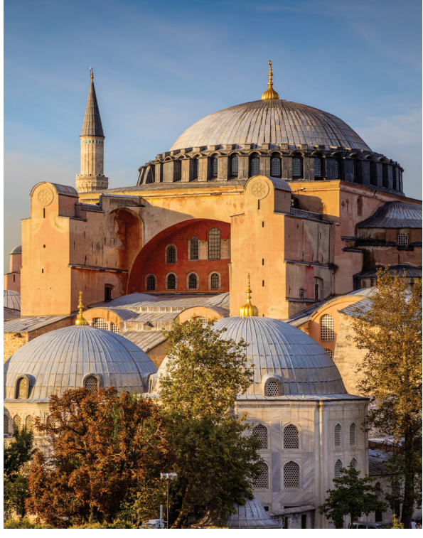
Istanbul's Hagia Sophia

Day 15: Depart for U.S. This morning we board an early flight for our return to the United States. B