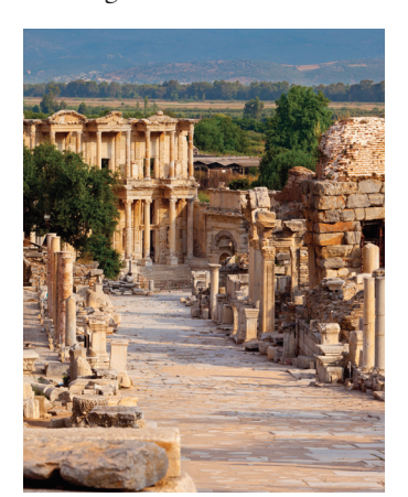
Ruins at Ephesus

Day 9: Kusadasi/Ephesus We return to Ephesus to visit the Basilica of St. John, the 6<sup>th</sup>-century ruins that stand over what is believed to be the burial site of John the Apostle. Then we learn about Ephesus through the ages, as we tour the Ephesus Museum, housing treasures from the archaeological site. After