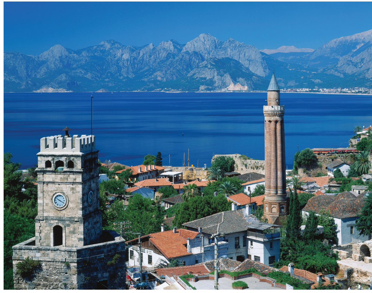
An Antalya landmark, the Yivli Minare (fluted minaret) overlooks the Turquoise Coast.

Ratings are based on the Hotel & Travel Index, the travel industry standard reference. Unrated hotels may be too small, too new, or too remote to be listed.