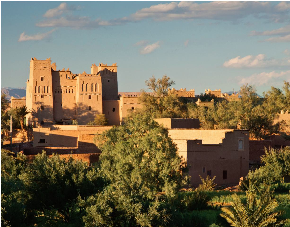
We encounter many of Morocco's age-old kasbahs on our journey.