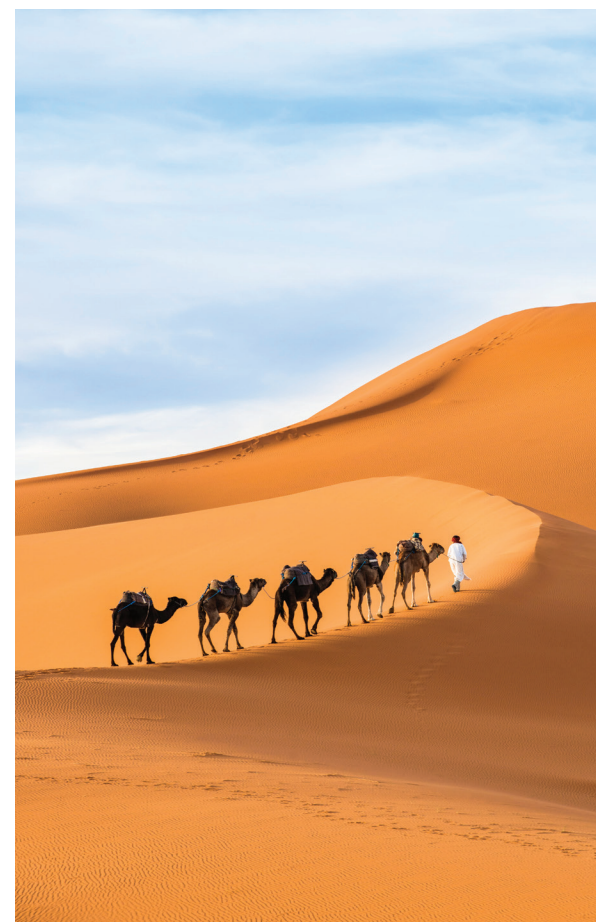
We ride camels in the Sahara on Day 8.

Day 14: Depart for U.S. After breakfast this morning we transfer to the airport for our return flight to the U.S. B