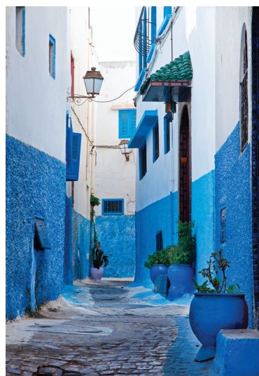
Rabat's Kasbah des Oudaias

Day 8: Erfoud/Rissani/Merzouga This morning we visit the city of Rissani, with its 18 th -century ksar , a virtually impenetrable warren of alleys. We enjoy a tour highlight this afternoon as we set out on a sunset excursion to the breathtakingly beautiful sand dunes at Merzouga on the edge of the Sahara. In the enormous silence we watch the sun set over the desert as we take a camel ride along the erg . Following this experience, we'll have dinner together in this desert setting before returning to our hotel tonight. B,L,D