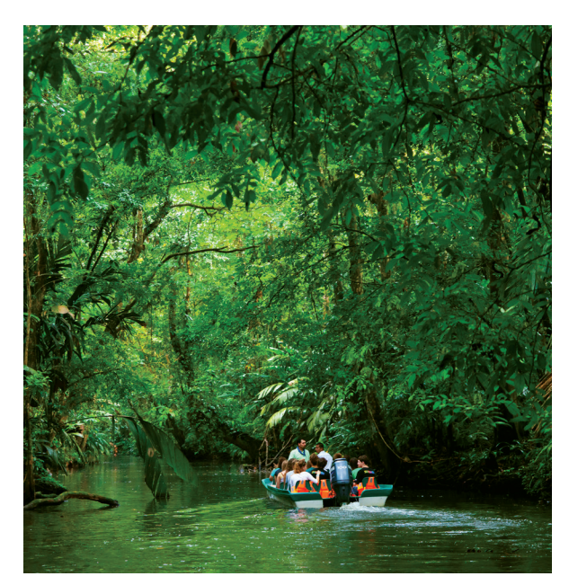
We explore Tortuguero's canals on the pre-tour option.

Day 11: Depart for U.S. We transfer to the airport this morning for our return flights to the U.S. B