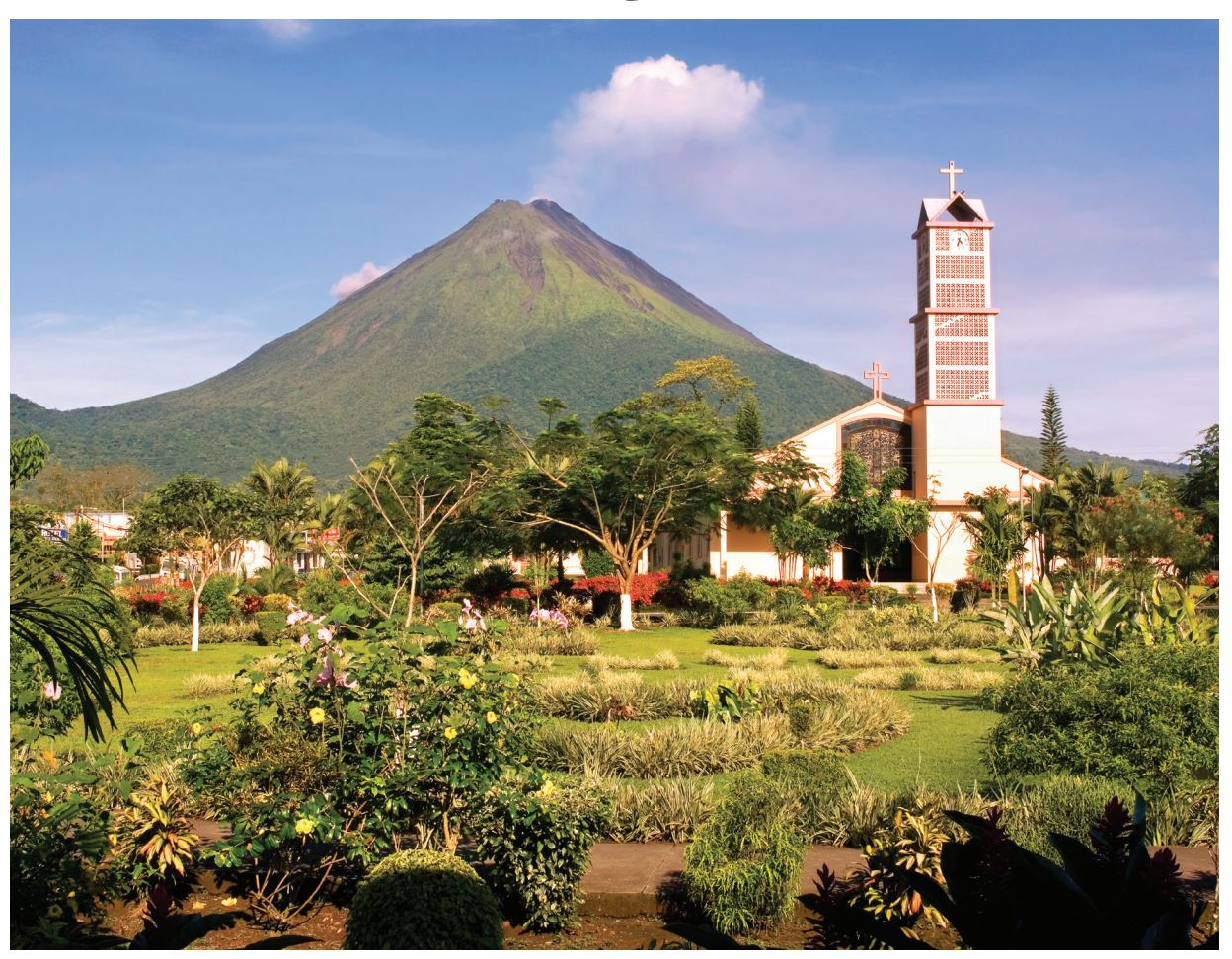
We see Arenal, one of the world's most active volcanoes, from a safe distance.

Ratings are based on the Hotel & Travel Index, the travel industry standard reference.