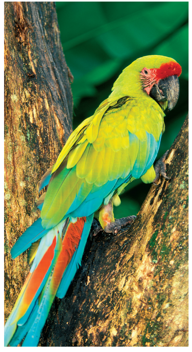
Local birdlife includes the Great Green Macaw.