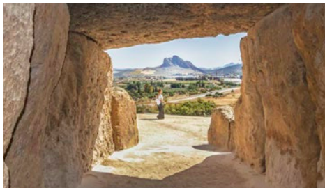
Dolmen of Menga, Antequera