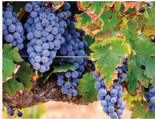
Vineyard near Ronda

Flamenco Performance. This evening, relish dinner at a local restaurant in Antequera while delighting in a special flamenco performance.