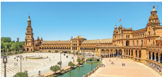
Plaza de España, Sevilla