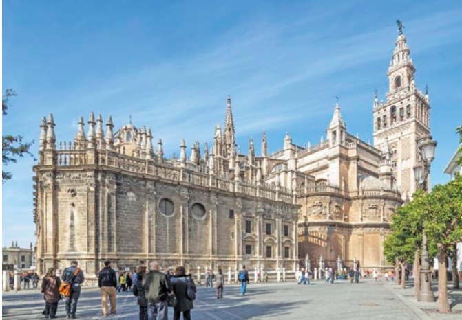
Cathedral of Sevilla