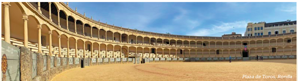
Plaza de Toros, Ronda

Sevilla City Tour. Journey to the cultural heart of southern Spain on a panoramic/walking tour. See the centuries-old bullring and the Moorish watchtower near the river. Enjoy a stop at the remarkable Plaza de España to see its canal and tiled alcoves representing the provinces of Spain. Next, tour the grand Real Alcázar, a medieval Moorish palace still in use today as a royal residence, and the stunning Cathedral of Sevilla, the world's largest Gothic church. These structures stand in the heart of Sevilla as proud representation of the Spanish Golden Age.