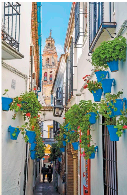
Jewish Quarter, Córdoba