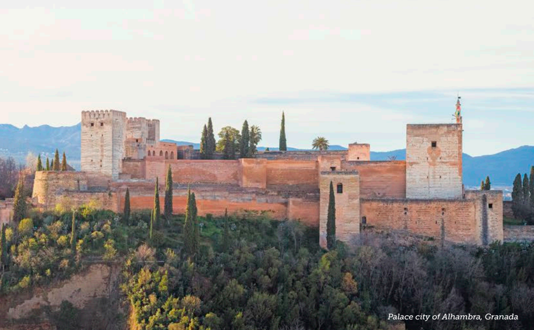
Palace city of Alhambra, Granada

Finish with a walk through the scenic Barrio de Santa Cruz and savor lunch on your own. Gather for dinner tonight at the parador.