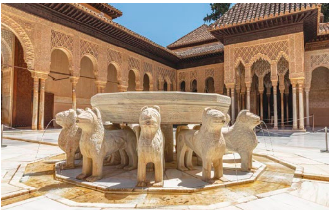
Court of the Lions, Alhambra, Granada