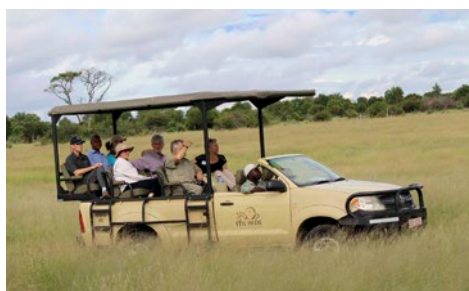
Top: Lion | Above: Safari