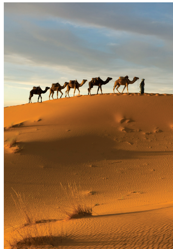
We ride camels in the Sahara on Day 8.

Day 13: Marrakech/Casablanca We leave Marrakech this morning by coach for Casablanca, Morocco’s largest and most cosmopolitan city. After a brief orientation tour, we visit the magnificent Hassan II Mosque, Morocco’s only functioning mosque open to non-Muslims. Tonight, we gather for a farewell dinner to celebrate our Moroccan adventure. B,D