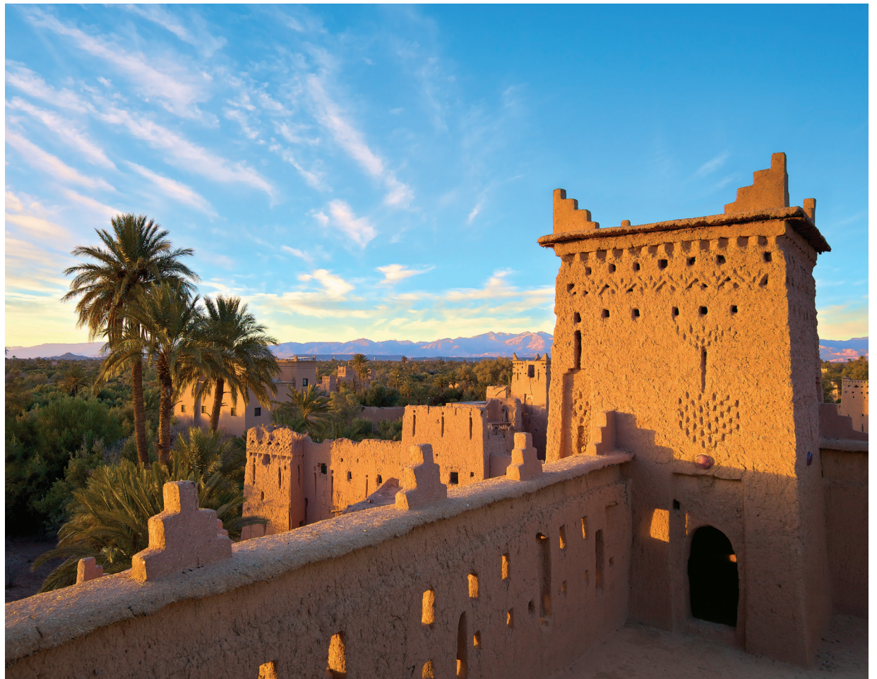
We travel the “Route of a Thousand Kasbahs” ancient caravan trail during our journey.

Ratings are based on the Hotel & Travel Index, the travel industry standard reference.