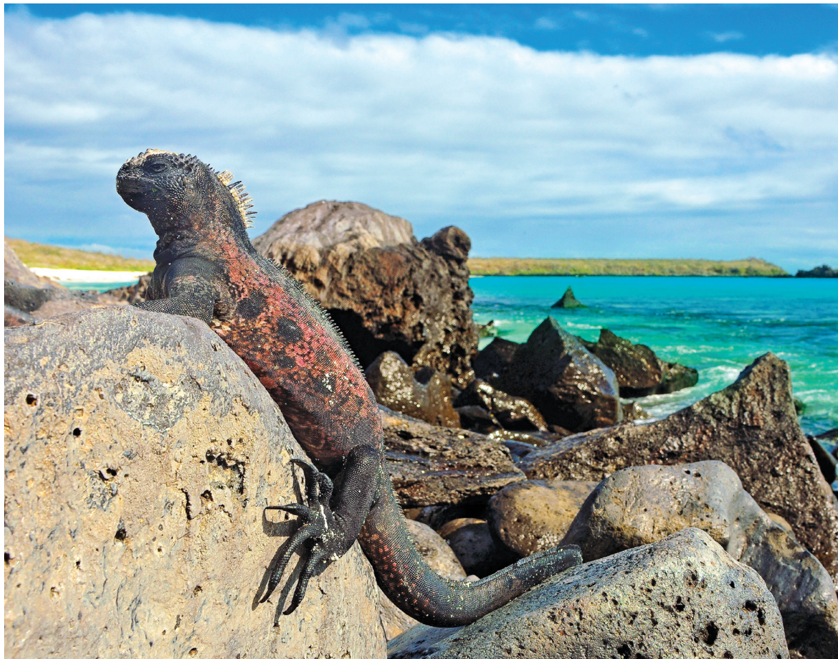
We'll encounter plenty of wildlife in the Galapagos, including relatives of this marine iguana.