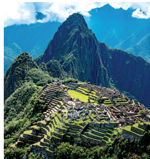
We explore the amazing ruins at Machu Picchu on Days 5 & 6.

Day 16: Quito/Depart for U.S. This morning we visit Quito's Botanical Gardens, featuring an orchidarium with more than 1,200 species of orchids and Ñaquito Market. Then we return to our hotel for an afternoon at leisure before tonight's transfer to the airport for our overnight flight to the U.S. B