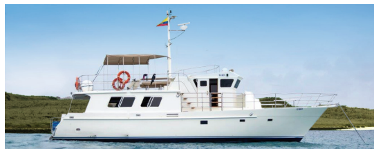
We stay in comfort for four nights in spacious rooms at the Royal Palm Galapagos, set in the lush highlands of Santa Cruz island, and enjoy day cruises aboard the Santa Fe, our privately chartered yacht.