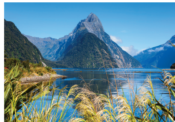
On Day 16, we cruise on Milford Sound.

Day 19: Rotorua Our morning tour includes a visit to Paradise Valley Springs, which showcases New Zealand's biodiversity with native flora and wildlife, including pigs, deer, and wallabies. Then we drive to National Kiwi Hatchery, dedicated to preserving New Zealand's national bird. This evening we visit Te Puia Thermal Reserve and Maori Cultural Center for a guided tour, dinner, and performance. B,D