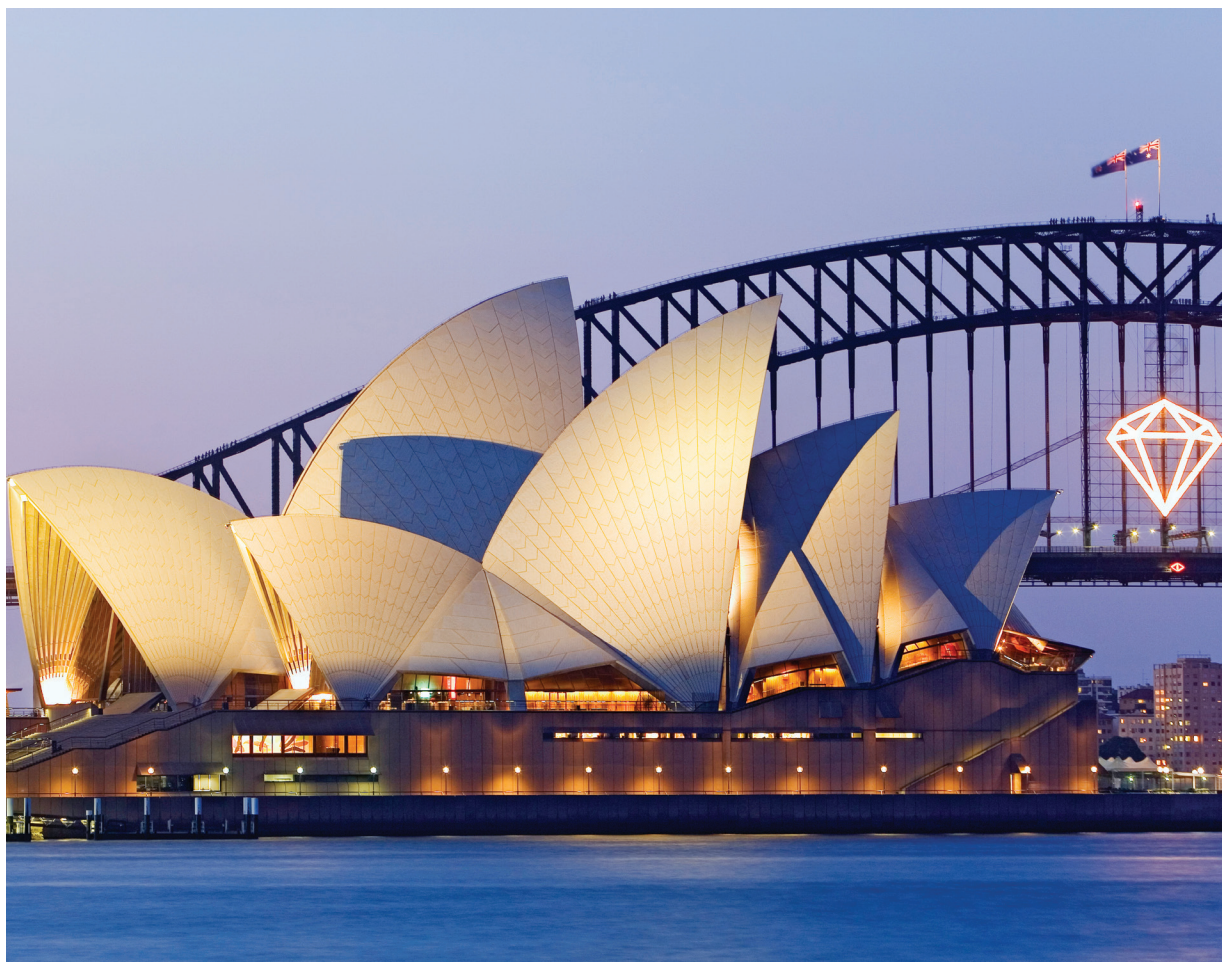
We tour Sydney’s signature Opera House on Day 5.