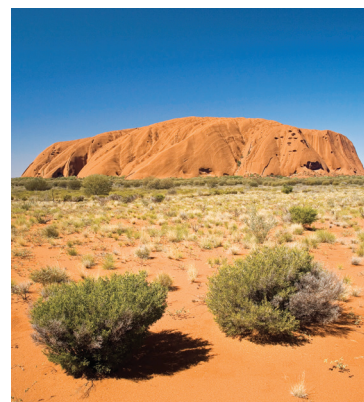
Aboriginal site of Uluru (Ayers Rock)

Day 14: Aoraki/Mt. Cook This morning's tour of alpine Aoraki/Mt. Cook Village includes a visit to the Sir Edmund Hillary Alpine Center, where we see a 3D plan-