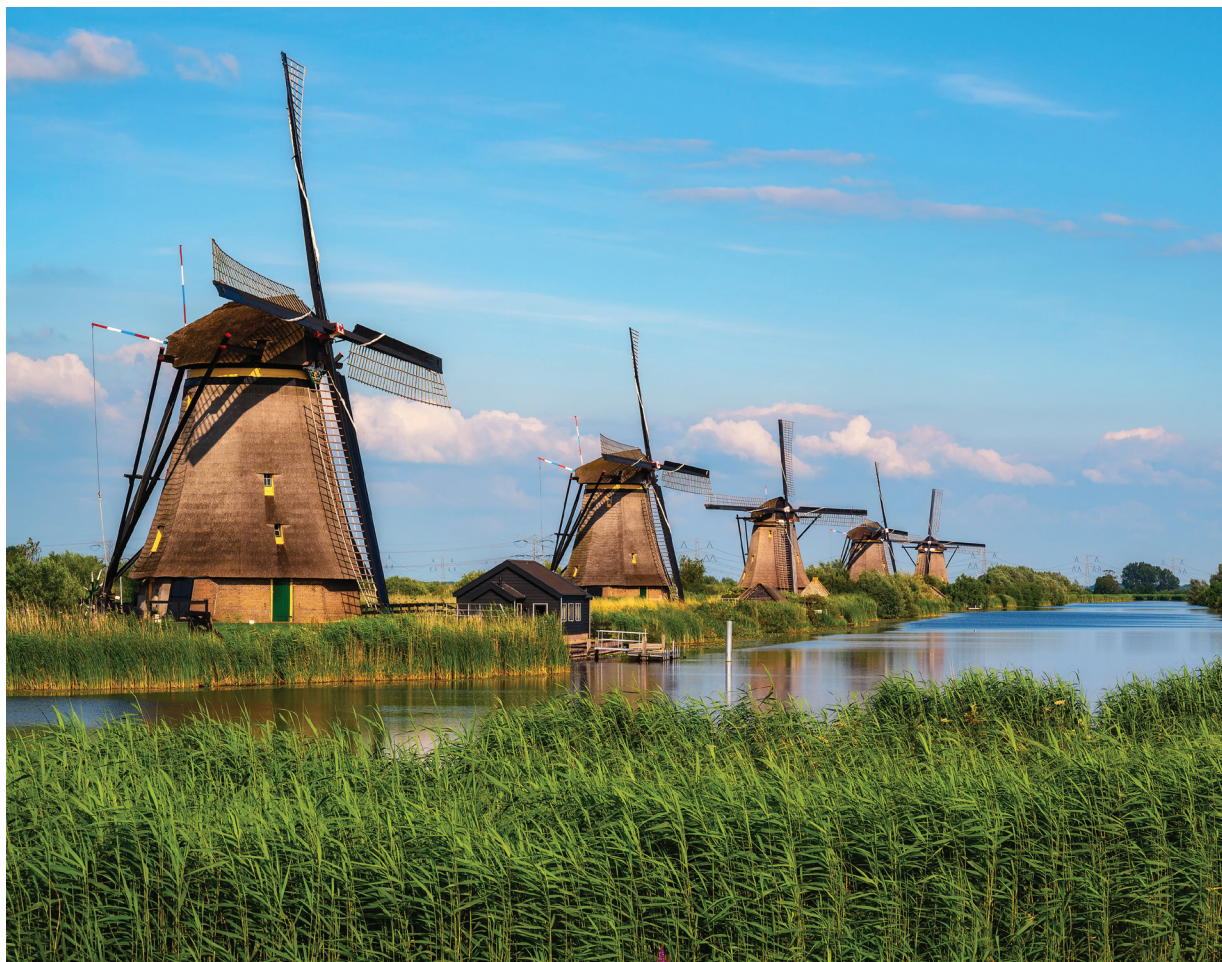
On Day 5, we visit Kinderdijk, whose windmills have been operating for 700 years.

Ratings are based on the Hotel & Travel Index, the travel industry standard reference.