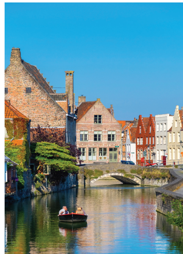
Canals wind through medieval Bruges.

sightseeing cruise on the River Seine. Then this afternoon is at leisure to enjoy Paris as we wish. Tonight, we celebrate our European adventure over a farewell dinner. B,D