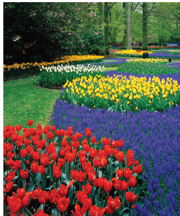
Tulips in bloom at Keukenhof

Day 8: Bruges/Bastogne/Luxembourg We travel today to tiny Luxembourg, the world's only Grand Duchy and once the crossroads of Western Europe. En route we honor the 77,000 American troops killed or injured in the deadliest battle of WWII, which took place in the Ardennes, the deeply forested region flanking Belgium, France, and Luxembourg. The Battle of the Bulge, as it became known, left an indelible mark on the region, as we see on our visit to the Mardasson Memorial, commemorating those who died here. We also tour the adjacent Bastogne