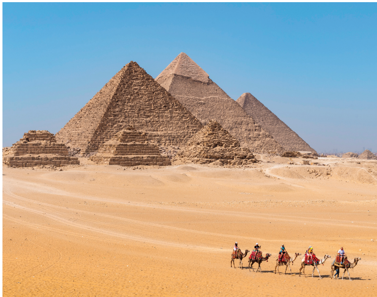
On Day 13 we travel to the Giza plateau to see the legendary pyramids, built 5,000 years ago as royal tombs.