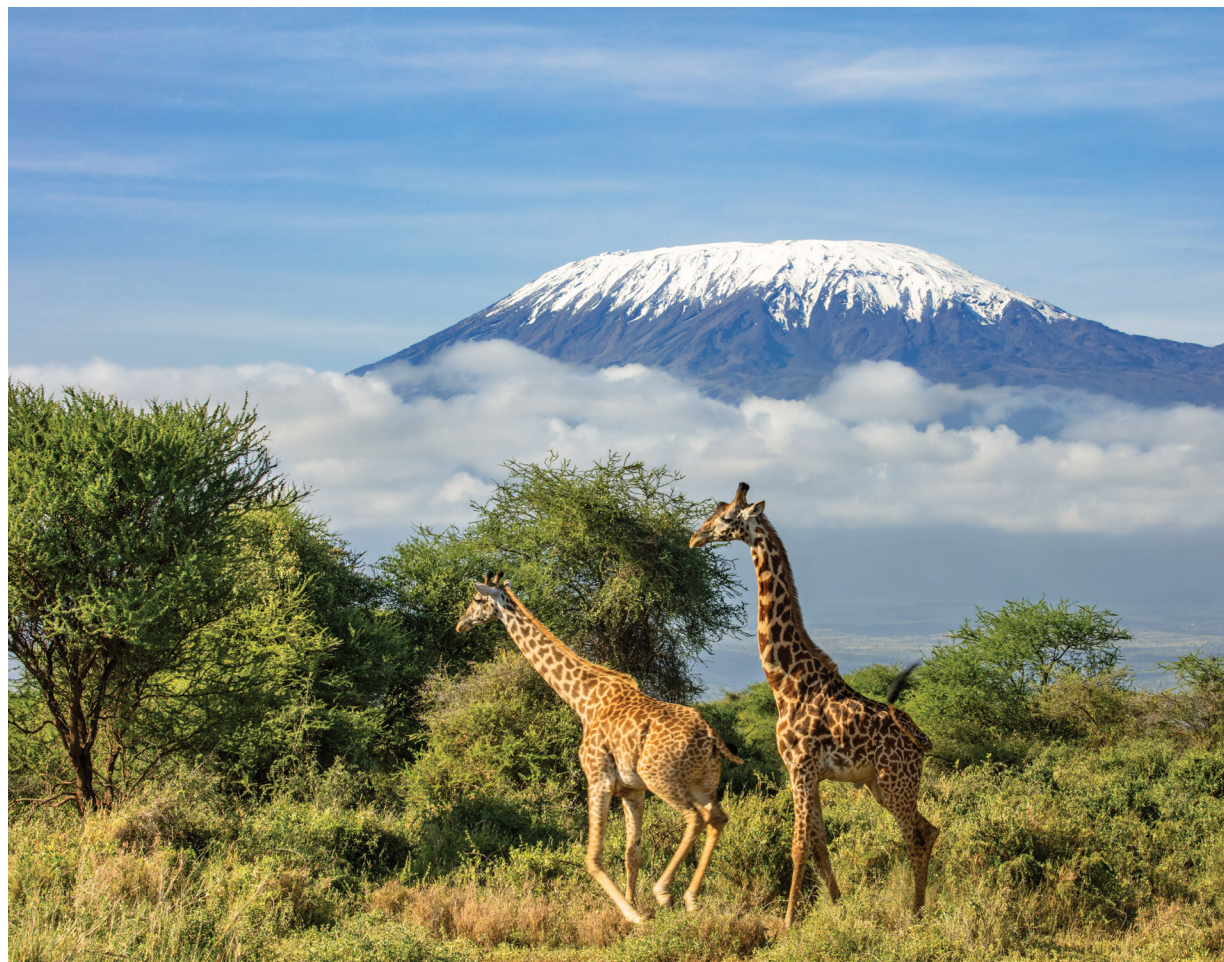
Giraffe roam Amboseli National Park in the shadow of Mt. Kilimanjaro.

Ratings are based on the Hotel & Travel Index, the travel industry standard reference.