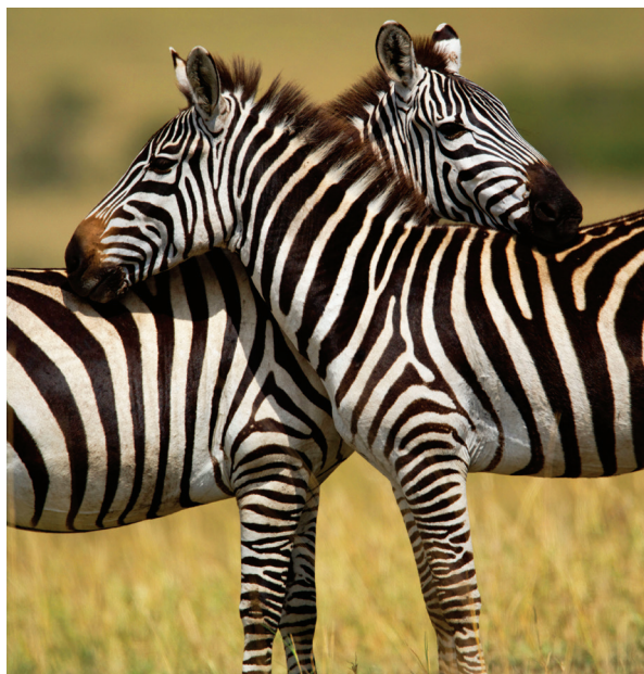
We're sure to see zebra.

Day 11: Serengeti/Masai Mara We leave Tanzania today, crossing into Kenya and continuing on to Masai Mara by air. Kenya's premier game reserve rich with animal life, the Mara is the traditional homeland of