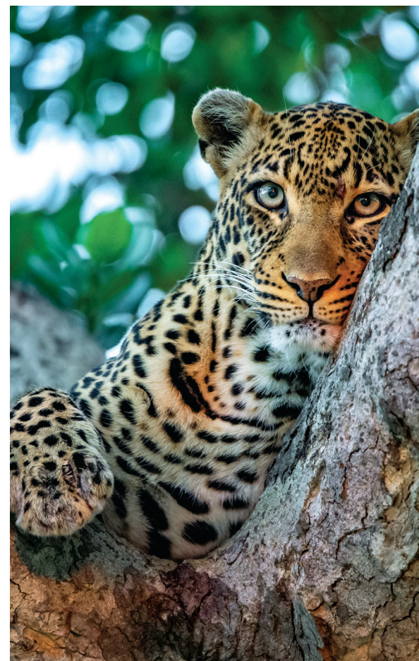
Leopard in Serengeti