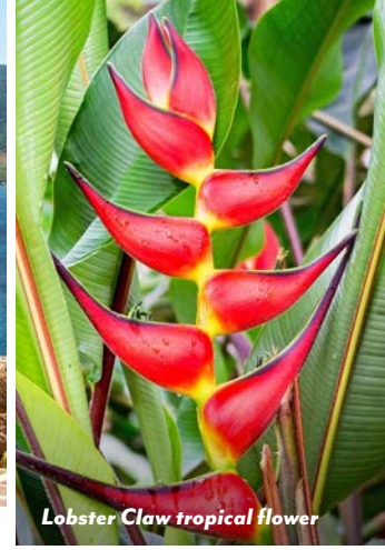
Lobster Claw tropical flower

and snorkeling in the calm, clear water.