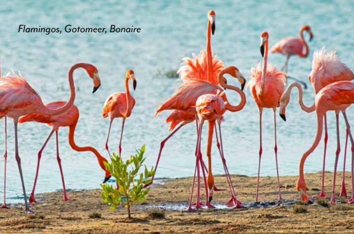
Flamingos, Gotomeer, Bonaire