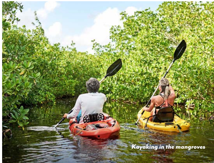
Kayaking in the mangroves