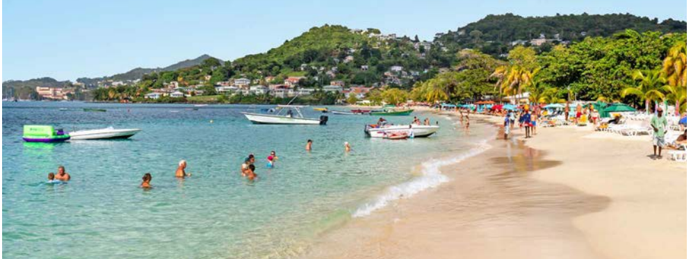
Grand Anse Beach, Grenada