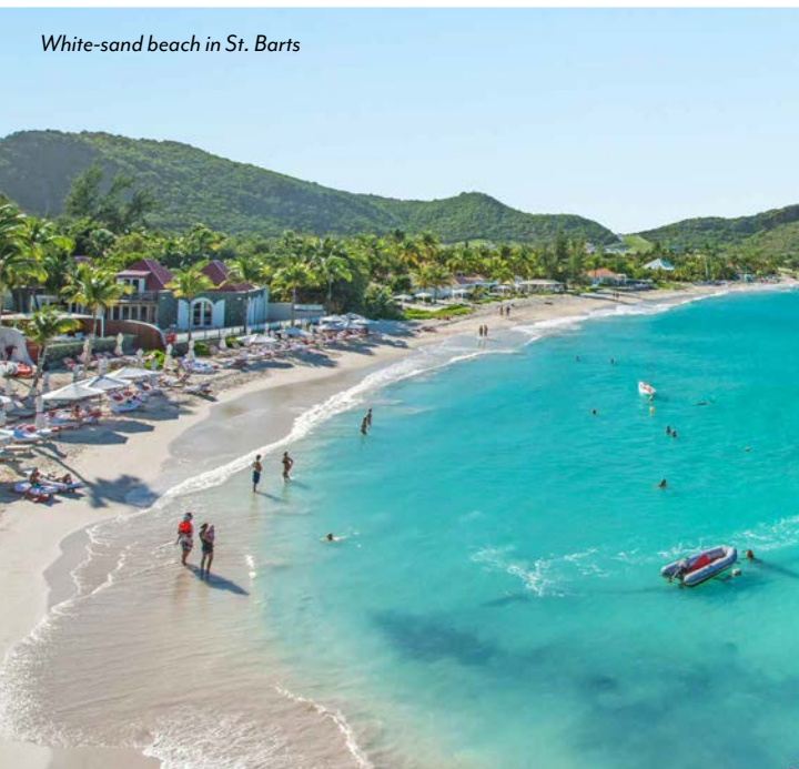
White-sand beach in St. Barts