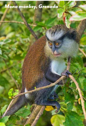
Mona monkey, Grenada

Garden, a botanical garden focused on medicinal herbs and spices. Tour the grounds with a private guide and learn about the fascinating trees, herbs and spices grown here, including coconut, nutmeg, mace, allspice, cinnamon, vanilla, turmeric and cloves. Or hike in a protected tropical rainforest situated around a crater lake in an extinct volcano. This reserve boasts stunning scenery and rich biodiversity — look out for Mona monkeys, emerald hummingbirds and other birdlife, and rare orchids during your hike. Or simply relax at Grand Anse Beach, famous for its white sand and calm turquoise water.