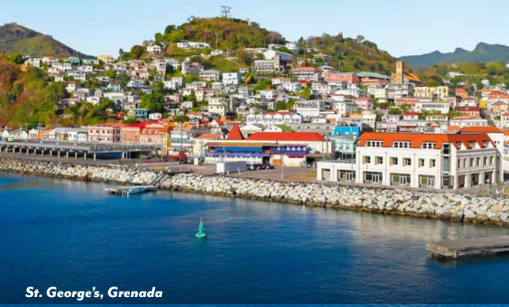
St. George's, Grenada