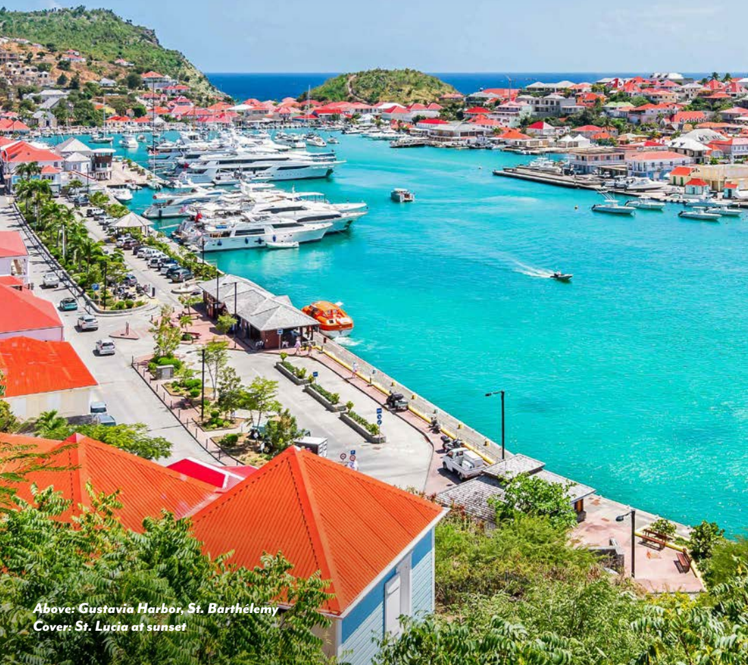
Above: Gustavia Harbor, St. Barthélemy Cover: St. Lucia at sunset