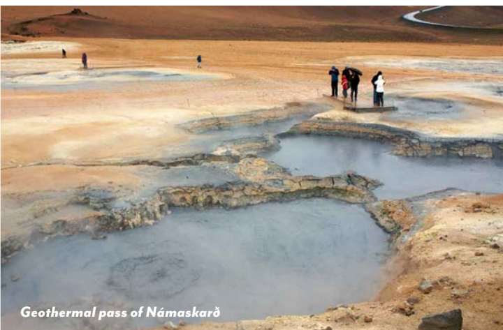
Geothermal pass of Námaskarð