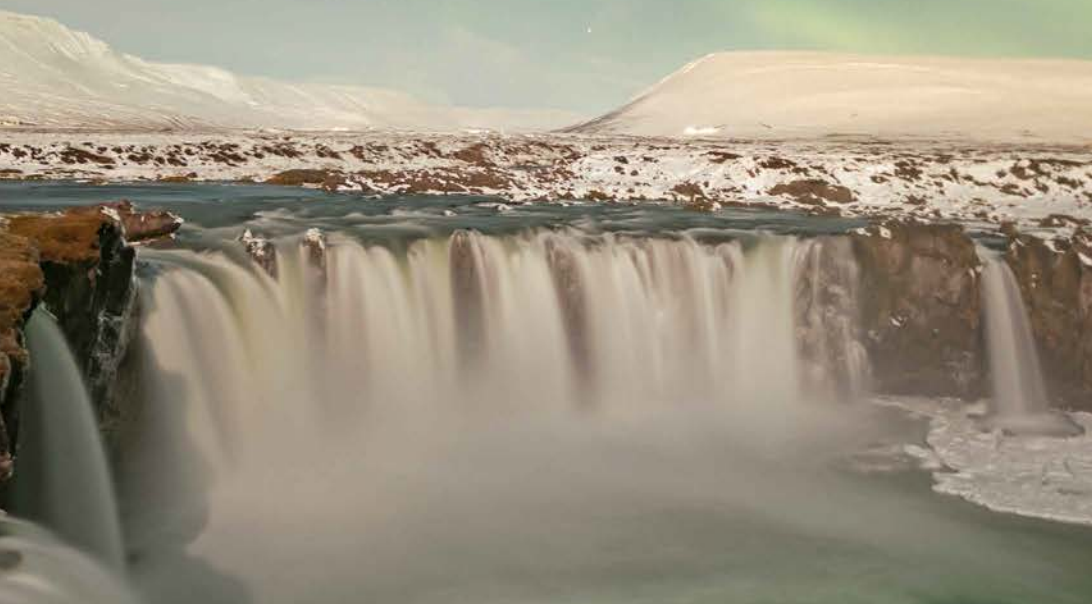
Above: Northern Lights over Goðafoss waterfall on Skjálfandafljót River Cover: Northern Lights