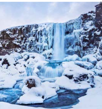
Þingvellir National Park

Following breakfast, depart for an excursion showcasing glistening waters, bubbling mud pots and misty waterfalls. Begin at Lake Mývatn, known for its strange lava formations, geothermal landscapes and incredible birdlife — all concentrated around a shallow, shiny lake formed by a volcanic eruption over 2,000 years ago.