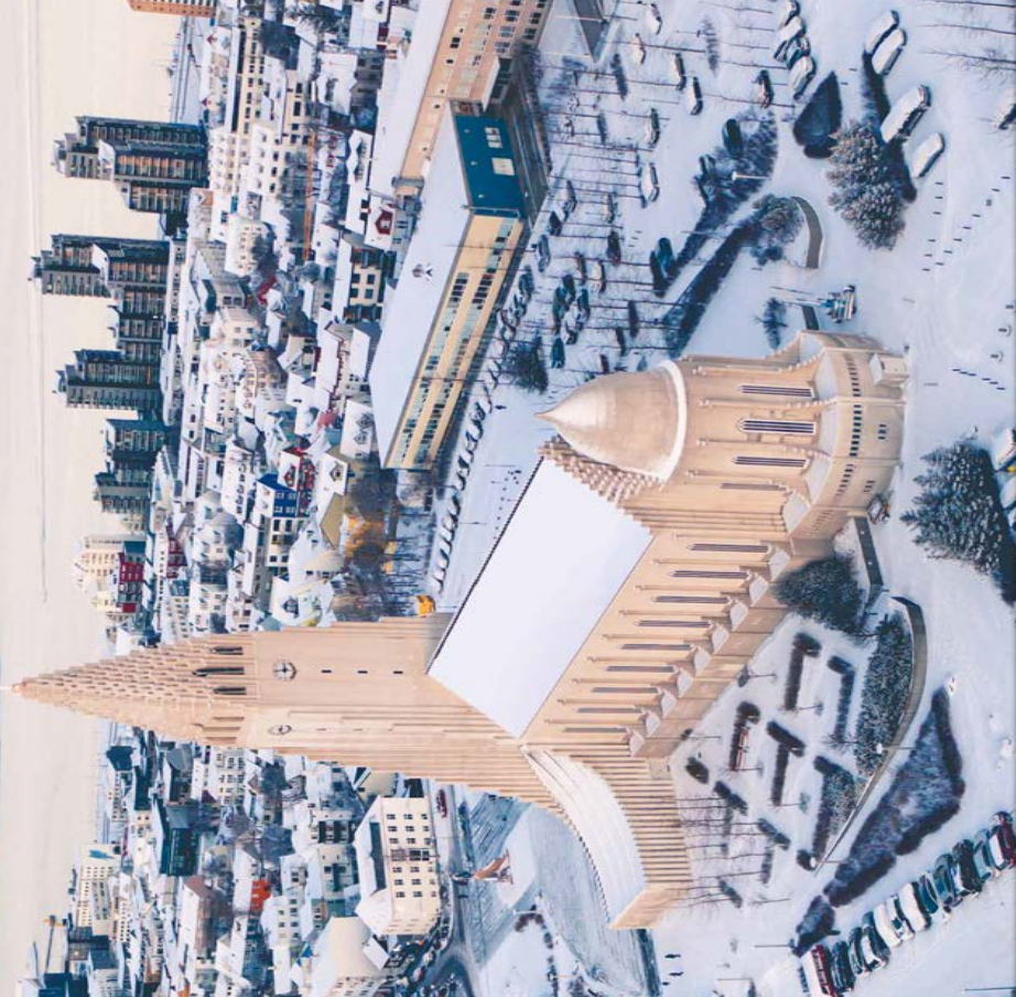
Hallgrímskirkja in Reykjavík, Iceland

SPECIAL SAVINGS* AVAILABLE SAVE $2,000 PER COUPLE!