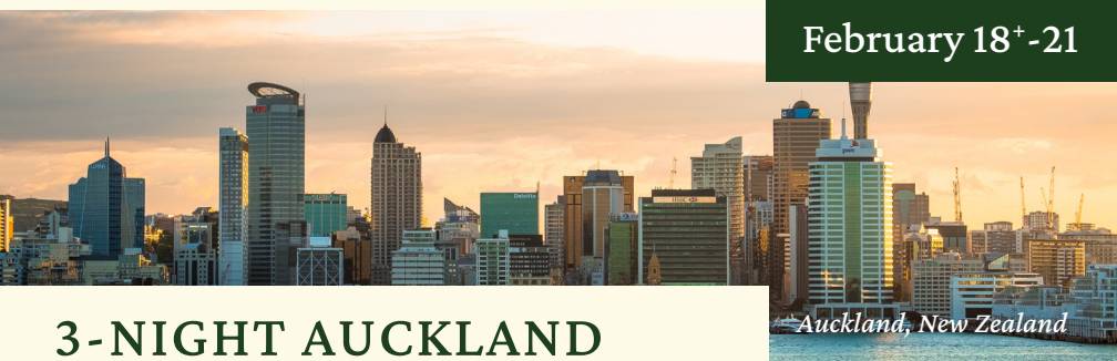
Auckland, New Zealand