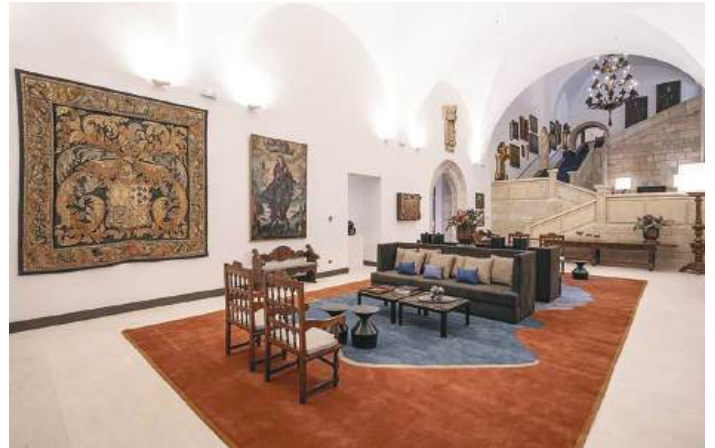
Parador de León

Formerly a monastery and royal hospital, this 16th-century property showcases León's imperial past in its cloisters, chapter house, and soaring public spaces. Rooms are elegant, and the on-site restaurant serves traditional Castilian fare.