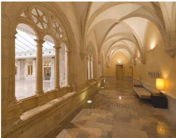
Hotel NH Palacio de Burgos

Housed in a 16th-century Gothic building near the Burgos Cathedral, this hotel blends historic architecture with contemporary comfort and views of the Arlanzón.