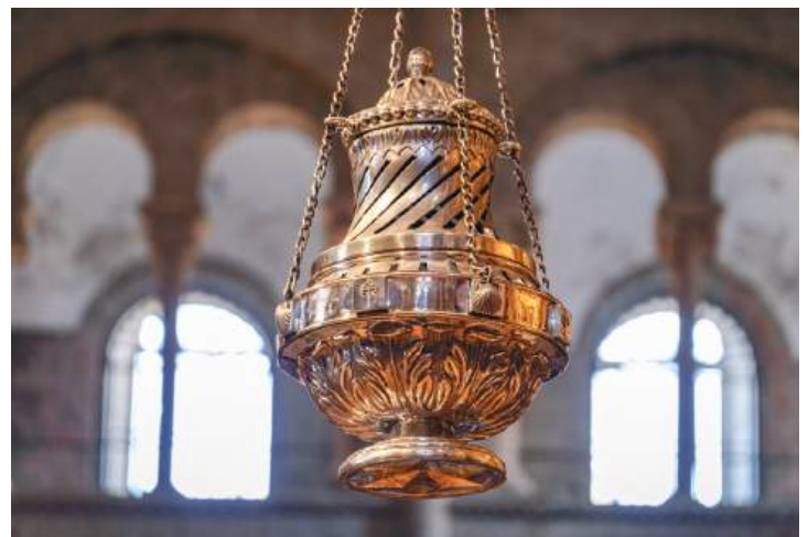
Botafumeiro, Cathedral of Santiago de Compostela

© 2026 Arrangements Abroad Inc. All Rights Reserved.