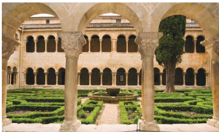
Monastery of Santo Domingo de Silos, Burgos

Approximate walking distance: 6.1 kilometers / 3.8 miles