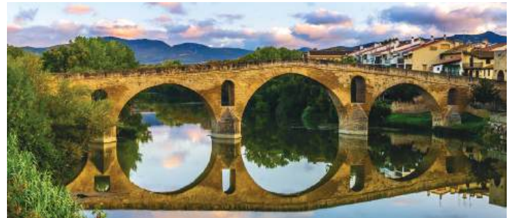
Puente la Reina