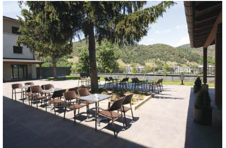
Parador de Villafranca del Bierzo

A restful pause before the final stretch to Santiago, this hillside parador offers mountain views, regional stone architecture, and a restaurant known for its seasonal cuisine.