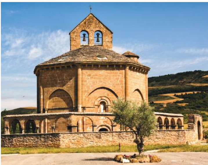
Santa María de Eunate, Izarbe Valley

Approximate walking distance: 6.5 kilometers / 4 miles