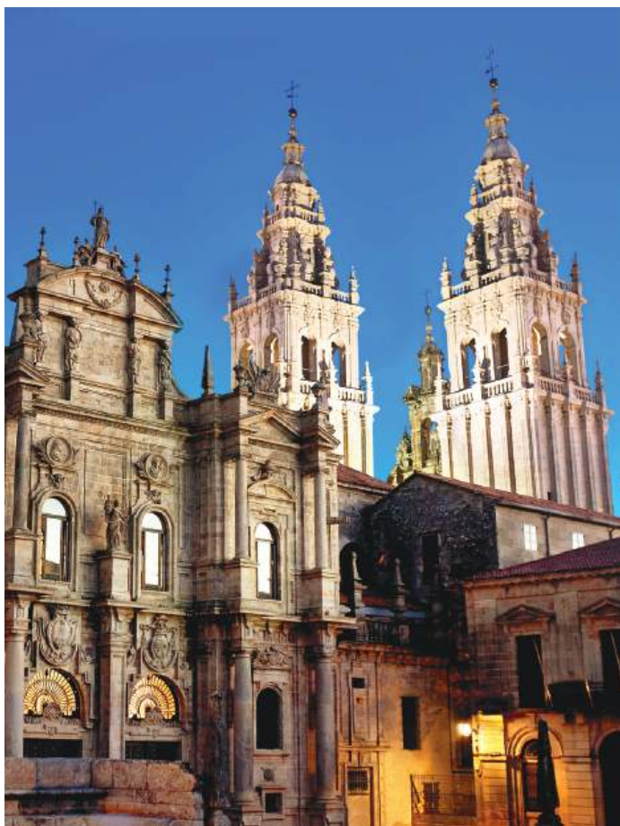
Cathedral of Santiago de Compostela