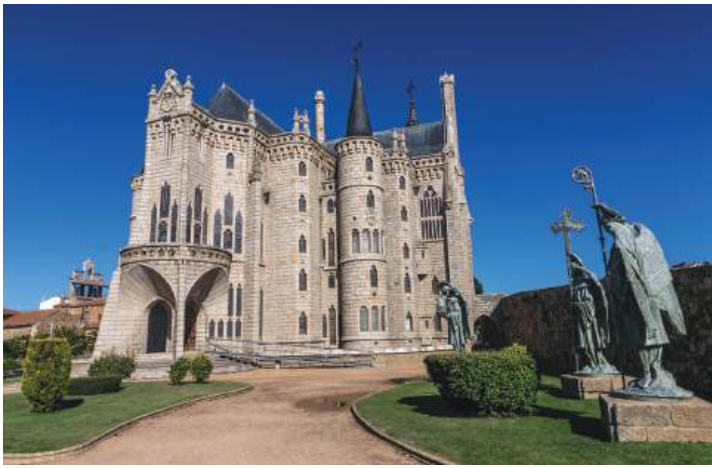
Episcopal Palace, Astorga