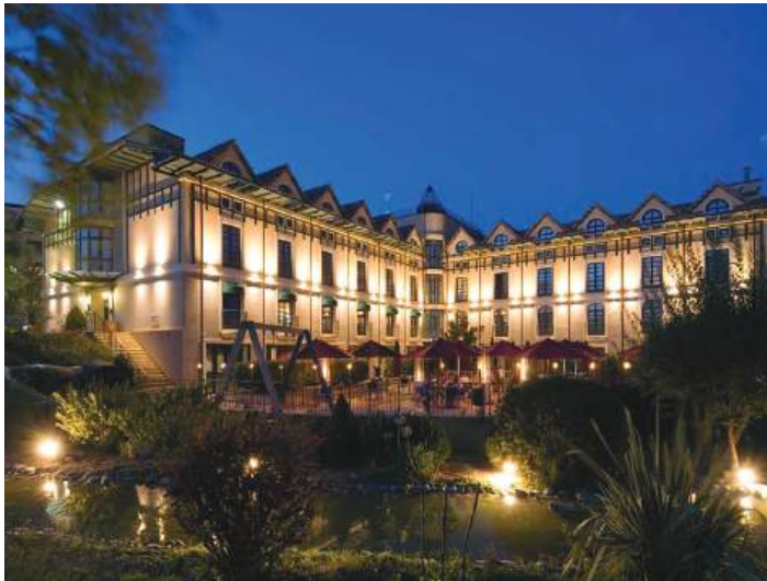
Hotel Villa de Laguardia

A quiet retreat amid Rioja vineyards, this hotel offers peaceful views, two restaurants, and a spa focused on regional treatments.