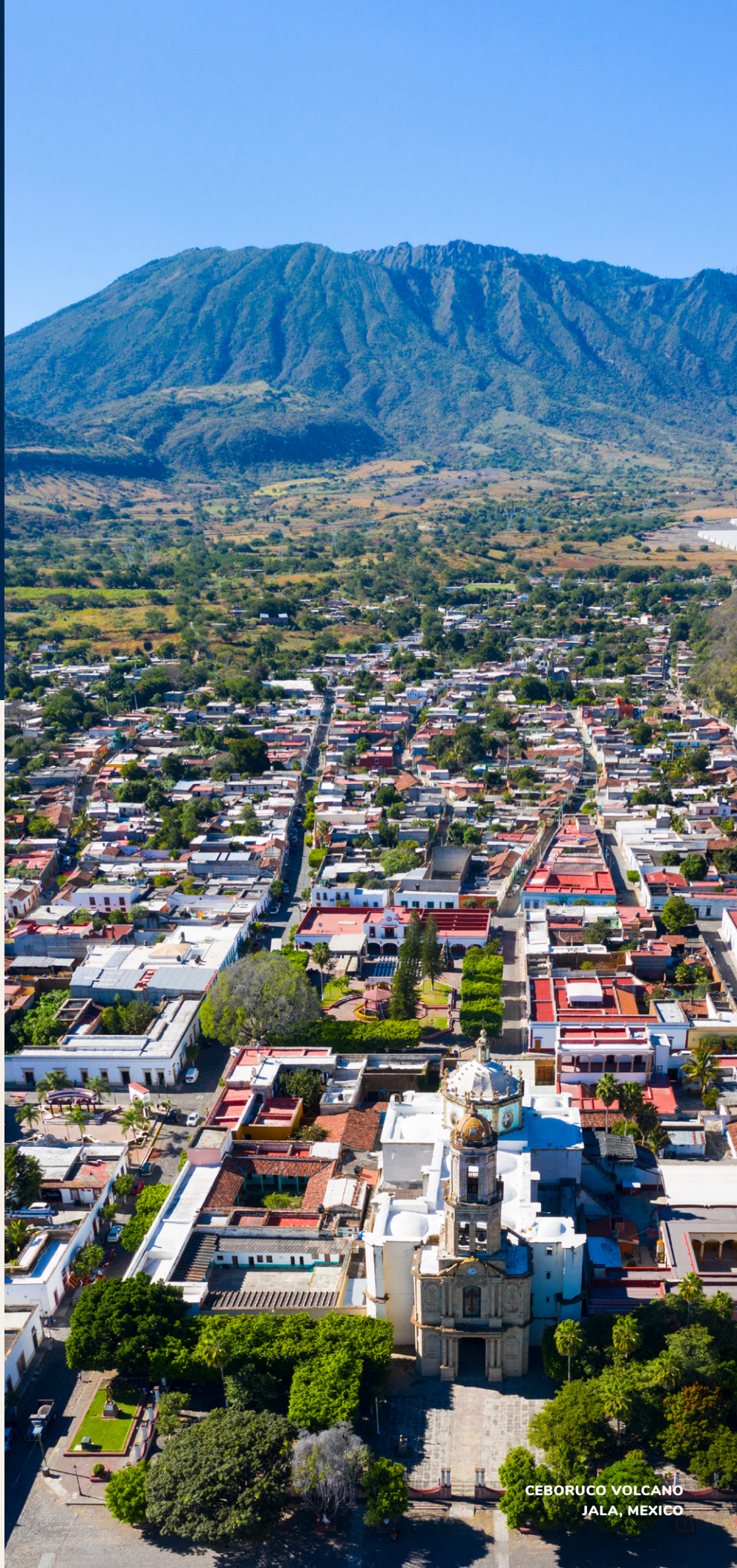
CEBORUCO VOLCANO JALA, MEXICO

CELEBRATE the total solar eclipse at a farewell dinner in Mazatlán's old downtown with its colorful and renovated French-inspired buildings