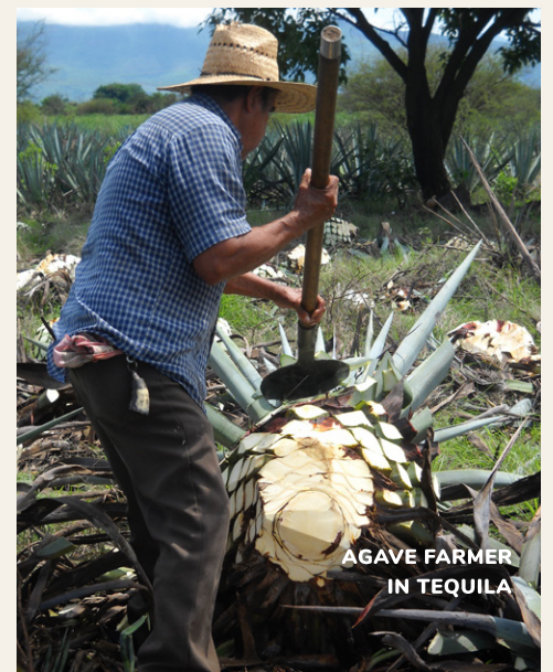
AGAVE FARMER IN TEQUILA

a spirit of adventure and anticipation and the desire to explore spectacular natural areas as well as urban areas are a must. There this is a relatively long drive from Tequila to Mazatlán (approximately five hours), broken by a tour of the Ceboruco volcano and lunch. Travel is by motor coach.