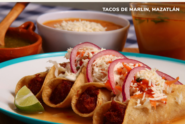
TACOS DE MARLIN, MAZATLÁN

To participate in a University of Michigan trip, all participants must be members of the Alumni Association of the University of Michigan. Please call the Alumni Travel team at (855) 764-0064 for more information.