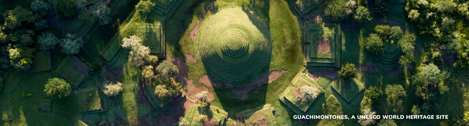
GUACHIMONTONES, A UNESCO WORLD HERITAGE SITE