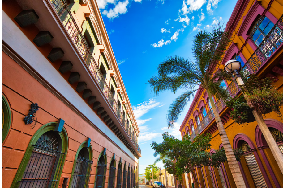
CLOCKWISE FROM TOP LEFT: GUADALAJARA; COLORFUL BUILDINGS IN MAZATLÁN; BEACHES OF MAZATLÁN; TEQUILA COCKTAIL.